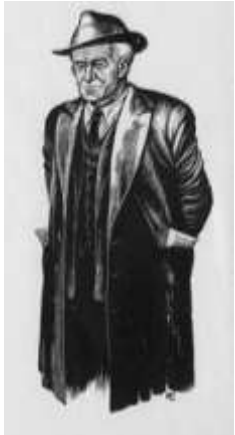
Peter Maurin, co-founder of the Catholic Worker movement

October is around the corner, which means that we will be having another yard sale fundraiser. These have been a great way to meet neighbors and raise a bit of money for the house. If you have any treasures stored up that you would like to donate for the sale, we will be collecting them the last two weeks of September. \Omega