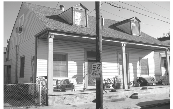
The Catholic Worker's St. Thomas House at 1910 Constance St.

The Catholic Worker fully supports halting the current Orleans Parish Prison expansion. Security does not lie in the privation of others' basic rights. Their track record shows that police and prison officials will fill as big a jail as can be built to the detriment of the city's poor and especially its' Black and Latino/a residents. Further radical changes are indispensable as well — including a thorough overhaul of the jail's funding and administration. Ω